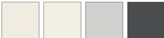
AdA-53-12 (1/32") AdA-53 (1/16") Almond AdA-58-12 (1/32") AdA-58 (1/16") Pumice AdA-31-12 (1/32") AdA-31 (1/16") Pewter AdA-10-12 (1/32") AdA-10 (1/16") Dark Grey