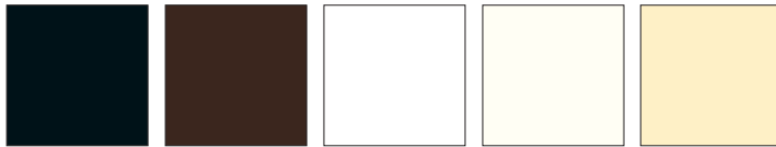
AdA-01-12 (1/32") AdA-01 (1/16") Black AdA-07 (1/16") Dark Chocolate AdA-02P-12 (1/32") AdA-02P (1/16") Bright White AdA-02-12 (1/32") AdA-02 (1/16") White AdA-22 (1/16") Ivory