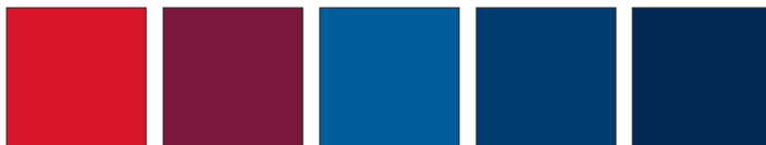
AdA-03 (1/16") Red AdA-12 (1/16") Wineberry AdA-04 (1/16") Blue AdA-27 (1/16") Blueberry AdA-09 (1/16") Navy Blue